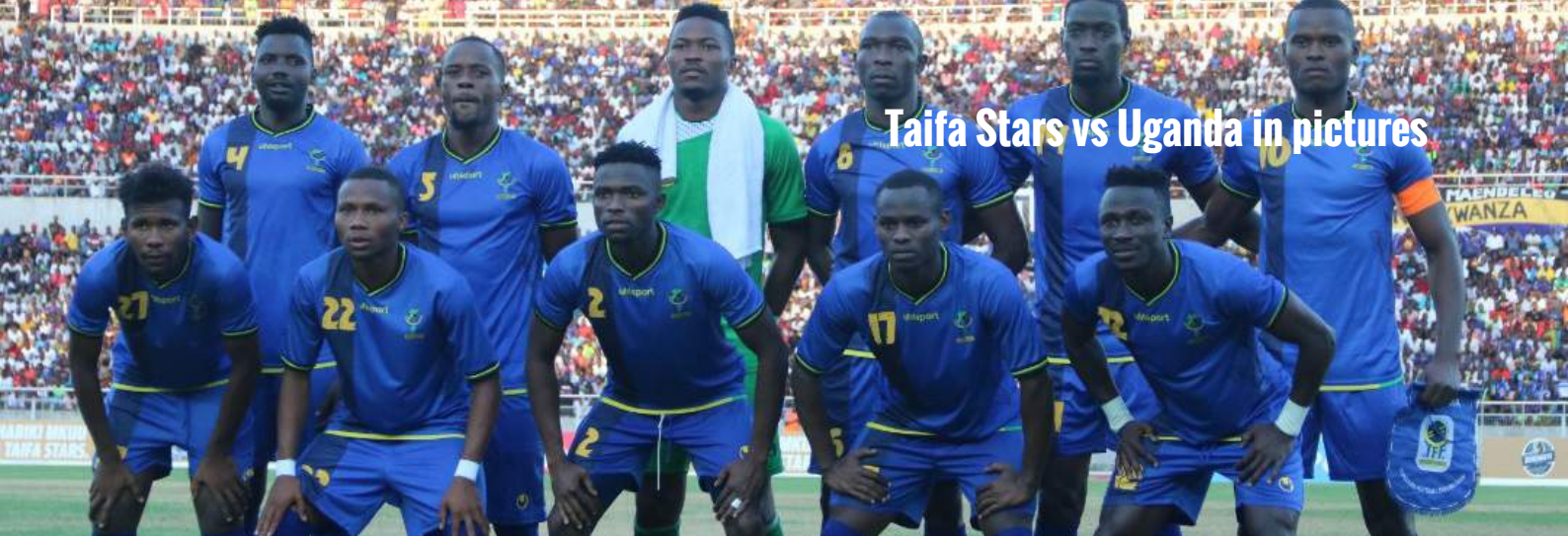
Taifa Stars vs Uganda in pictures